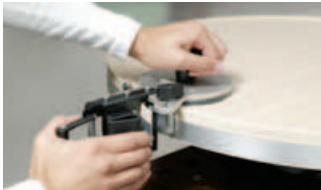
Placing the guillotine on the glued edgeband. Trimming the overlapping edgeband.